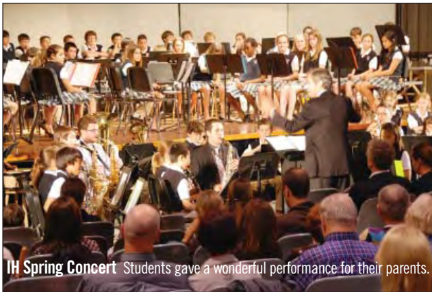
IH Spring Concert Students gave a wonderful performance for their parents.

We are so proud of everything our IHers have accomplished throughout the school year and look forward to creating wonderful new memories next year!