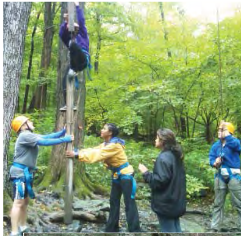
CLIMBING HIGH Stanwich's sophomores spent two days working on team and individual challenges.